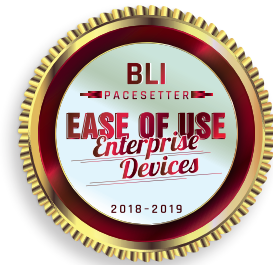
"PaceSetter Award in Ease of Use 2018-2019"