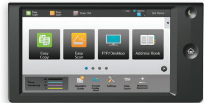
Sharp's customizable touchscreen display offers a user-friendly graphical interface, and is common across 30+ models.